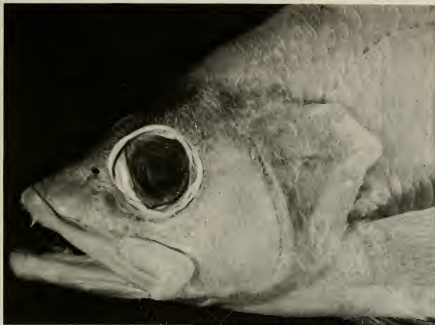
Fig. 2. Plectranthias exsul , paratype, MCZ 52520, 140 mm SL.

teeth; band broadened at anterior end of jaw; 1 to 3 stout exerted canines on each side of jaw near symphyseal diastema; 1 to 3 stout recurved canines on each side of jaw about one-third distance from symphysis to posterior termination of dentition; inner teeth of band somewhat enlarged; inner teeth near symphysis recurved and distinctly enlarged. Vomer and palatines with cardiform teeth; vomerine teeth in chevron-shaped patch; palatine teeth in band, anterior portion of band somewhat broadened and usually slightly curved toward vomer. No teeth on tongue or pterygoids.